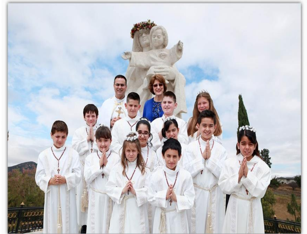
ST. EPHREM CHURCH FIRST HOLY COMMUNION 05/07/2016